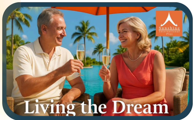
Living the Dream