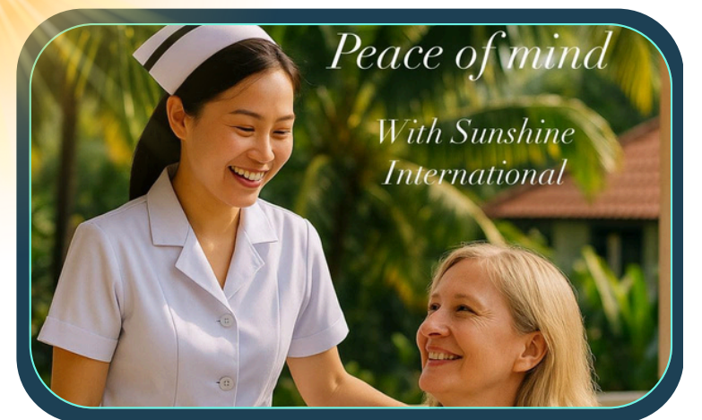
24 hour on site medical staff