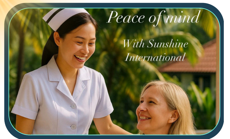
24 hour on site medical staff

A great place for the early and late retiree